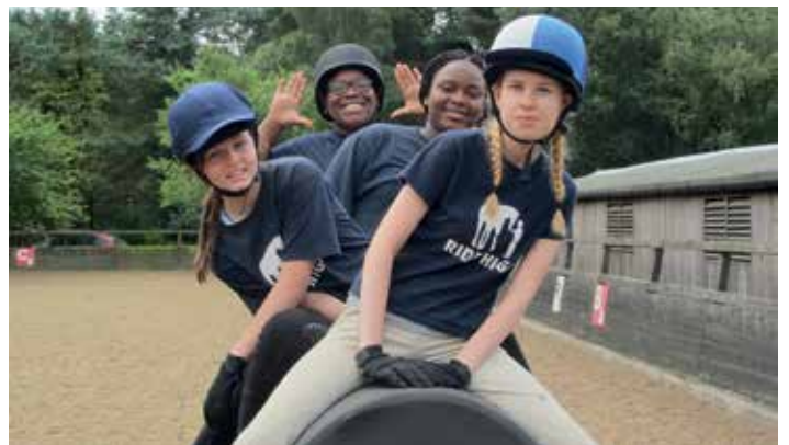
Embracing the challenge of the vault at the Fortune Centre!

During the school holidays Ride High organise a variety of fun, inspirational and educational trips for our members. This summer, trips included Ascot and Newmarket, Woburn Safari Park and Whipsnade Zoo. Trips are a key part of the Ride High programme and enable us to maintain a connection with our children over the holidays. Some of our members enjoyed a fun-filled three day residential trip to the Fortune Centre of Riding Therapy.