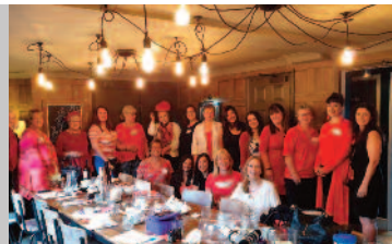
Busy Women Networking Rocked Red