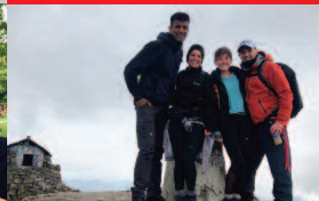
Colleagues at Sysmex UK climbed the Three peaks