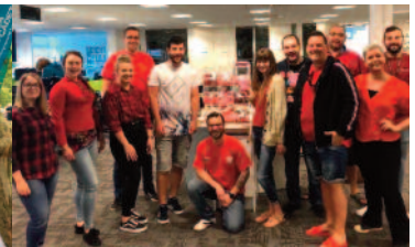
Colleagues at Mirus IT Rocked Red in the office